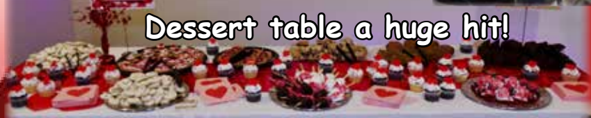
Dessert table a huge hit!