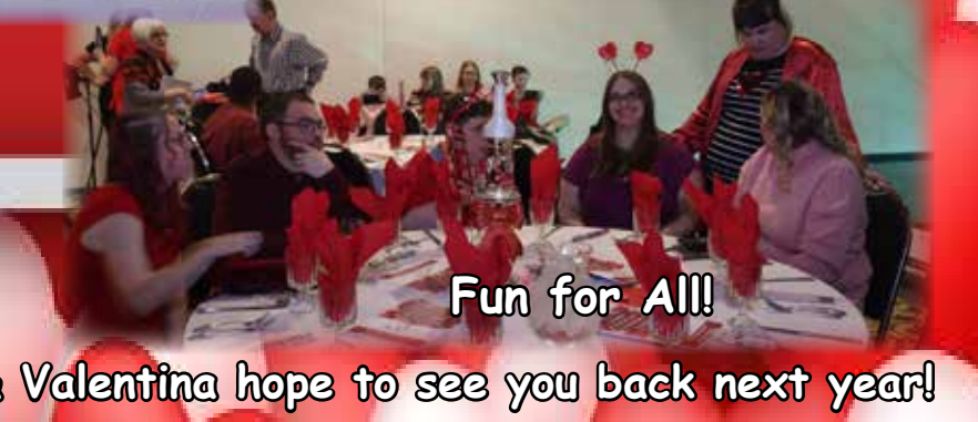
Fun for All!