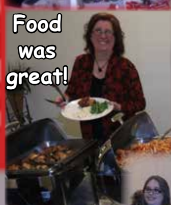
Food was great!