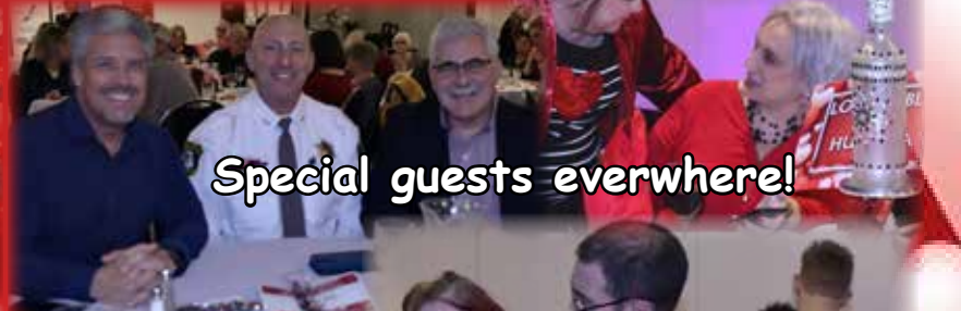
Special guests everywhere!